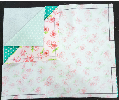
STEP THREE (A):